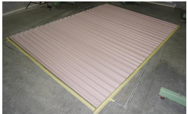
Test specimen installed in laboratory for test