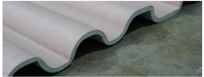
Closeup view of test specimen material showing face, edge and corrugated profile